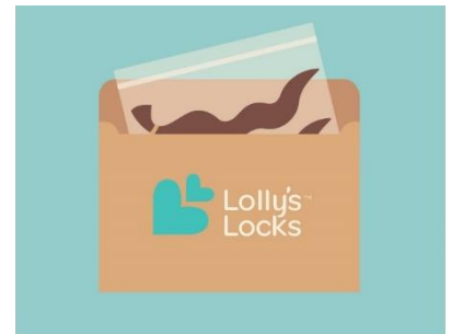
6. Mail your hair with a completed donation form to Lolly's Locks!