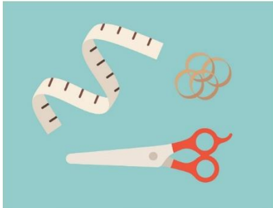
1. Gather a tape measure, hair ties, and scissors.