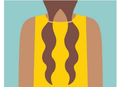
3. Tie multiple separate and even ponytails, securing them with hair ties.